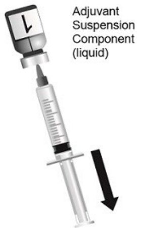
Figure 1. Cleanse both vial stoppers. Using a sterile needle appropriate for administering a vaccine intramuscularly and a sterile syringe, withdraw the entire contents of the vial containing the Adjuvant Suspension Component (liquid) by slightly tilting the vial. Vial 1 of 2.