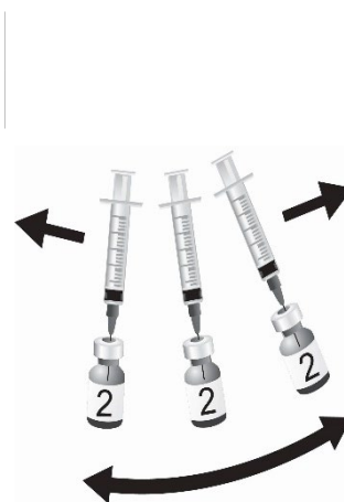
Figure 3. Gently swirl the vial until powder is completely dissolved. Do not shake vigorously.